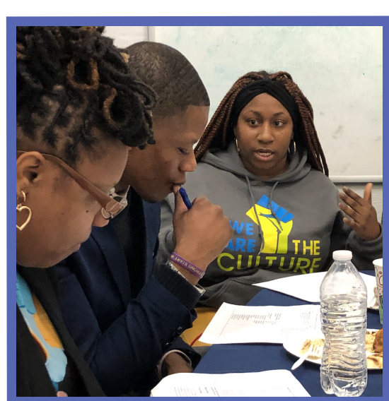
E.L. Haynes Public Charter School parents discuss how to recruit and engage more parents in their educational equity efforts at the school

For all families to equitably access a school's resources and shape the school's policies and practices so that they reflect the culture and values of the students they serve, families need to understand how our nation's policies and practices, as well as the interpersonal behaviors that reflect those policies, have gotten us to a state where a child's race and income level can statistically predict life outcomes. This awareness can only come about when parents form relationships with each other, share their stories, and delve into difficult and uncomfortable conversations about race and